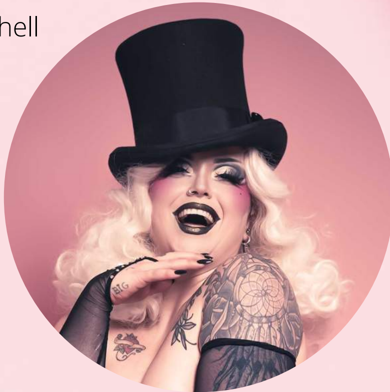
Bettie Bombshell Burlesque